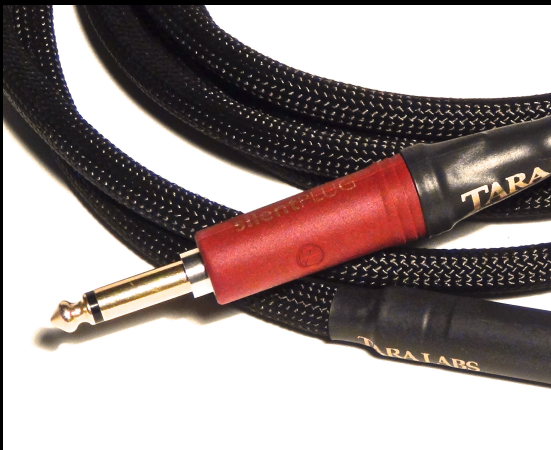
Professional Studio Instrument Cable