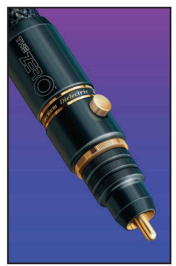
Illustration 2. "The Zero" RCA plug, equipped with a valve that allows a vacuum to be drawn inside the air-tube.

tor ends" without causing vacuum leaks, but should not be sharply bent anywhere between these flexible end segments. Also, obviously, any attempt to remove the screw-down crowns of the valves on the RCA/XLR connectors—or to disassemble the connectors themselves—may result in loss of vacuum and the voiding of warranties.<sup>4</sup>