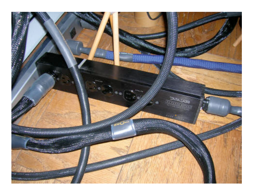
The AD/6 and PM/2 like to sit on ERAudio boards. Golden Sound DH Squares with a little BluTack were also good. Methinks these passive conditioners benefit from a little resonance control.