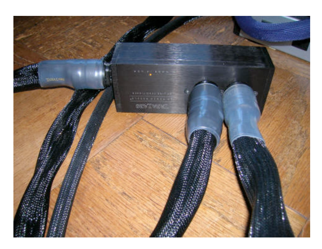
Power Conditioning: Shunyata Hydra vs. TARA PM/2

The Shunyata Hydra AC conditioner and its associated Anaconda PC are recognized benchmarks in the realm of passive power conditioning products. The Hydra and Anaconda are vaunted for their noise reduction and smoothing effects, but mostly I put them in when I need to lower the tonal balance and grab some more weight and body—there is nothing like them for this purpose. One of the original Hydras has graced my reference system on and off for a long time. I had it feeding the ART Audio Jota amp. (I only use it on the amp—I feel it does less damage there, for reasons I will get to shortly).